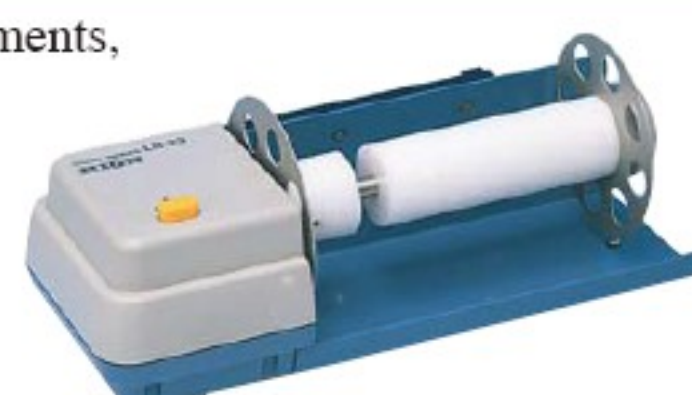
Chart winder LB-23

For long-term measurements, a chart winder with a matching design is available.