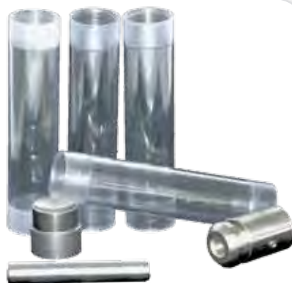
6751 grinding vials